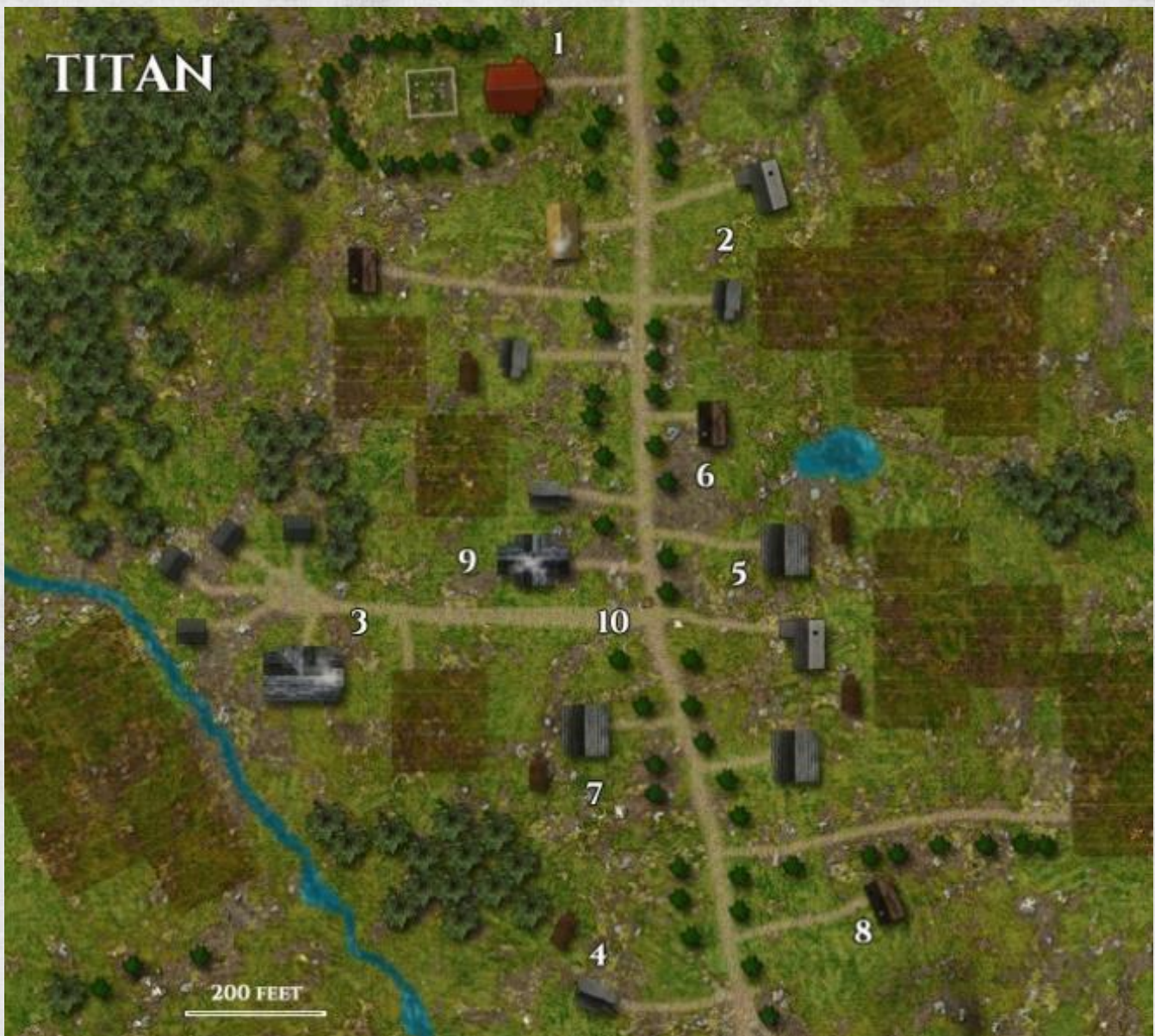
Map of Titan