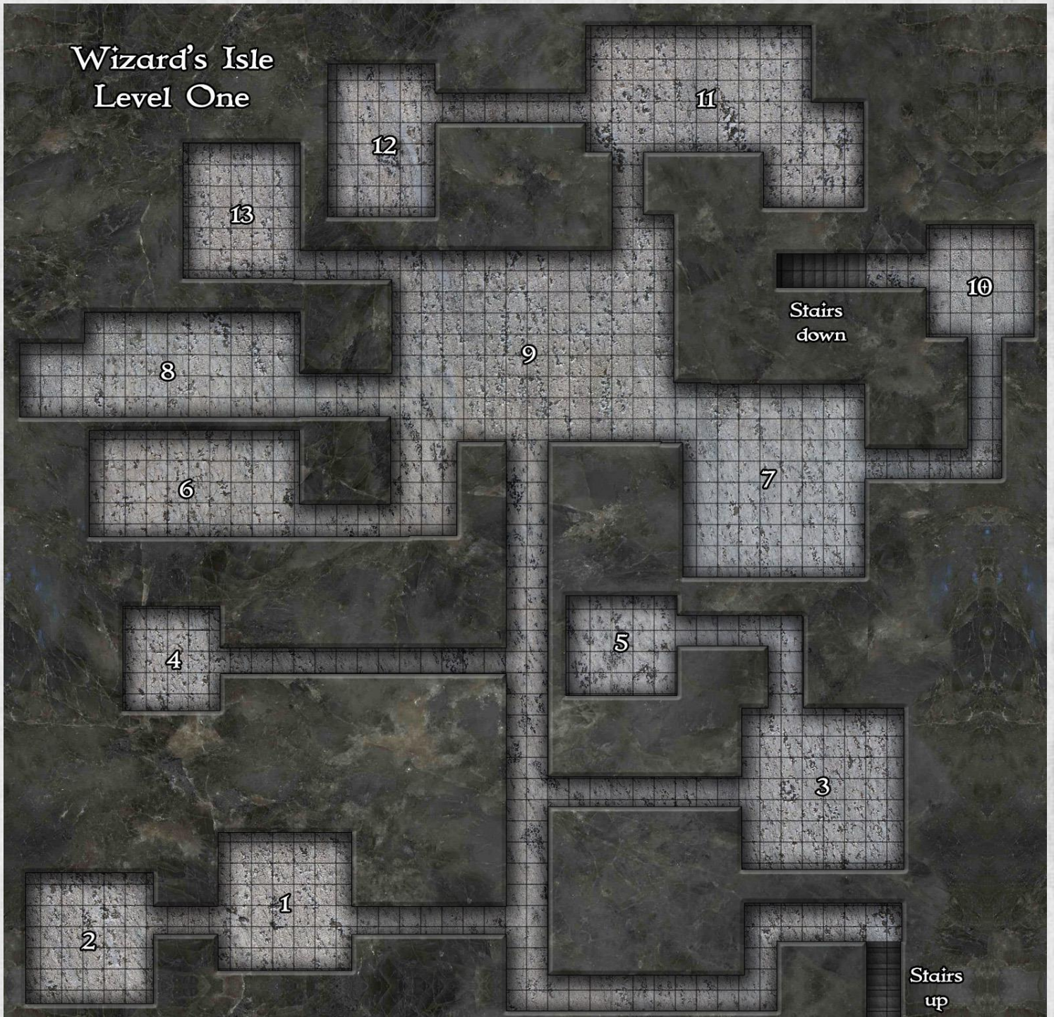
Wizard's Isle Level One (1 square= 5 feet)