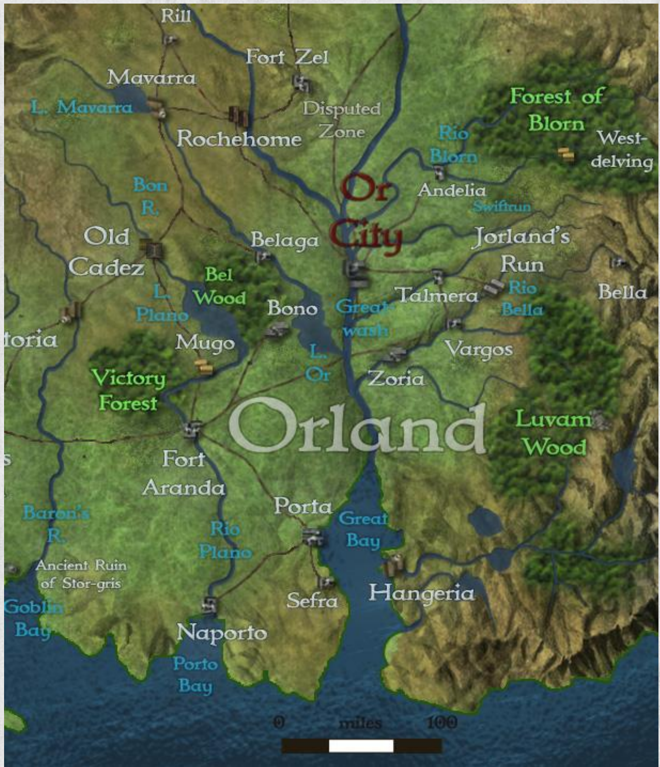
The Kingdom of Orland